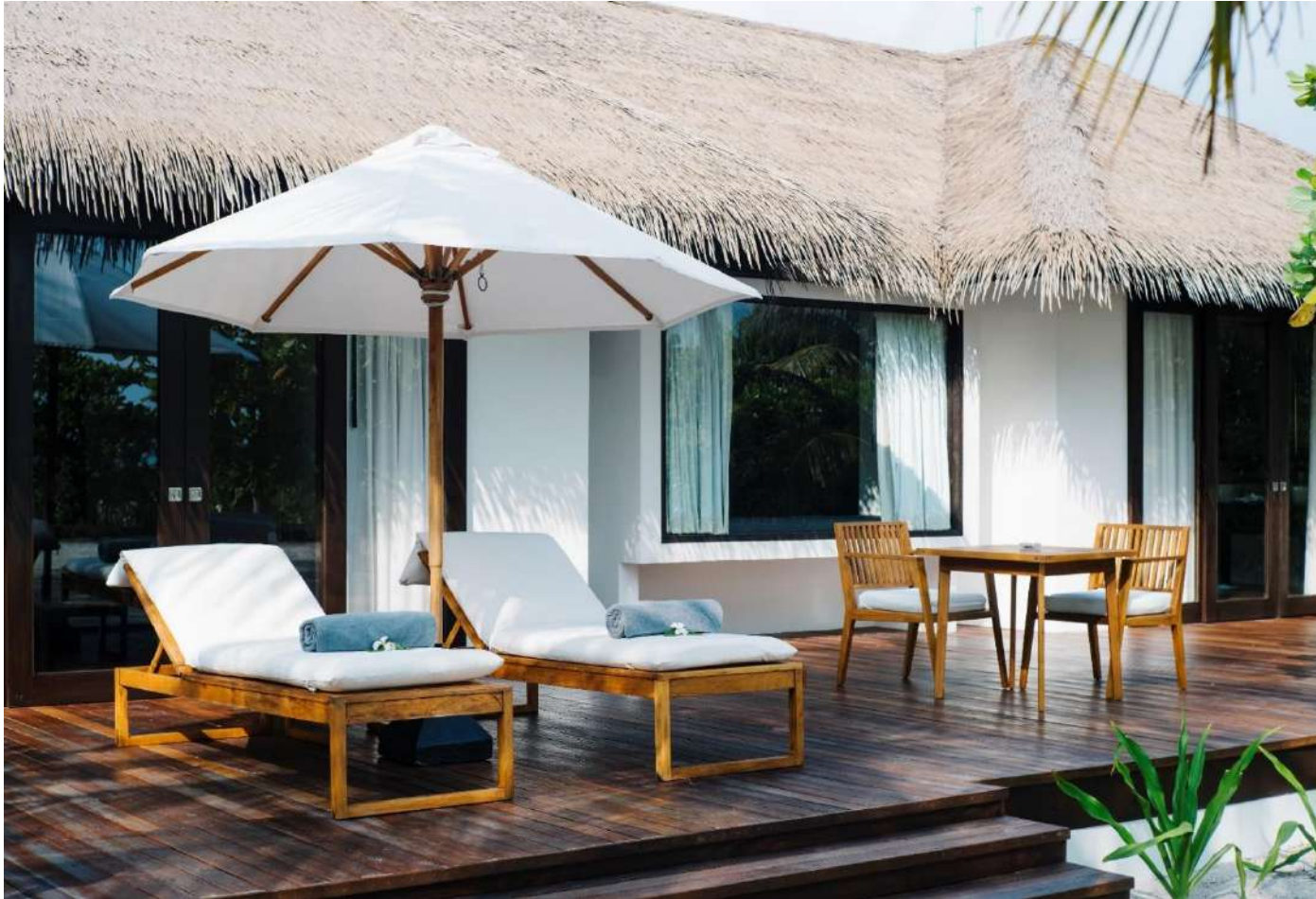
Eastern side of the island