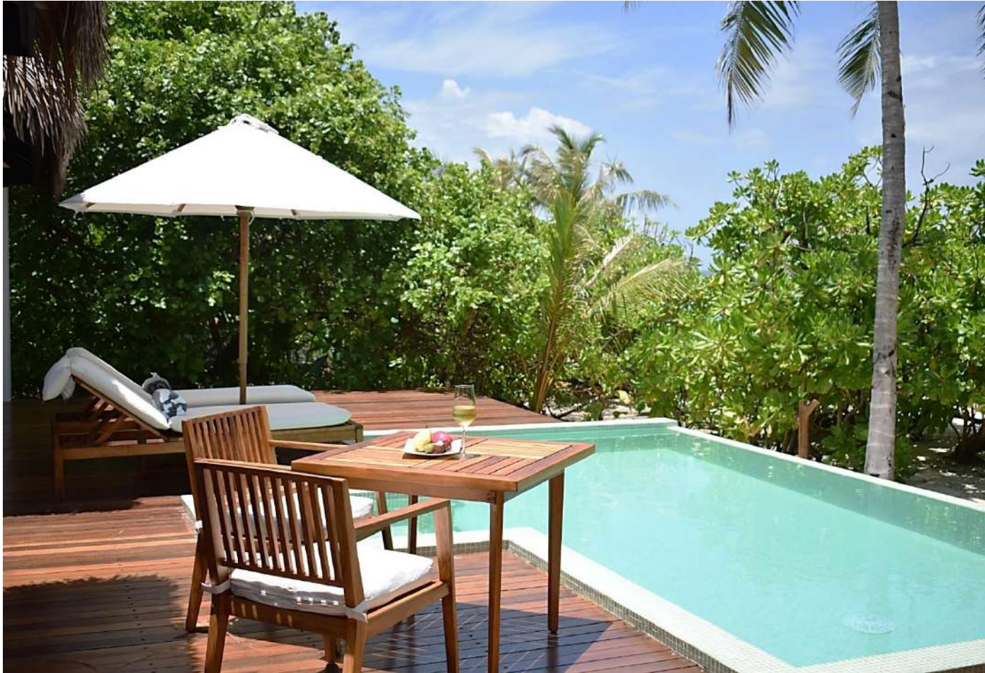
Eastern side of the island