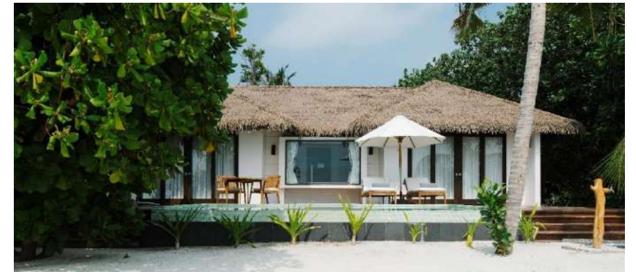
Max Occupancy: 2A + 1C