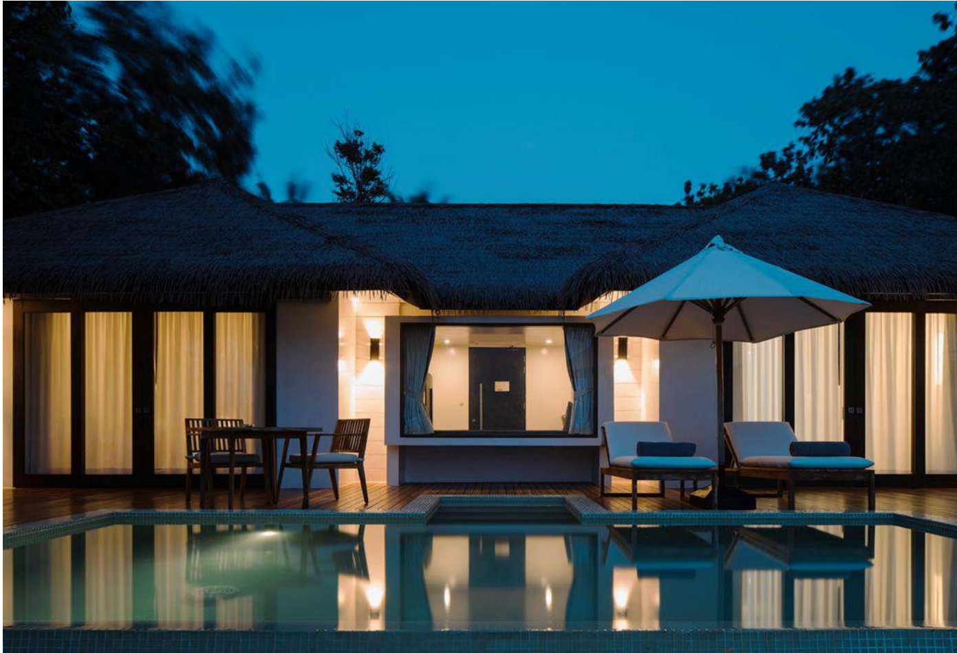
Western side of the island