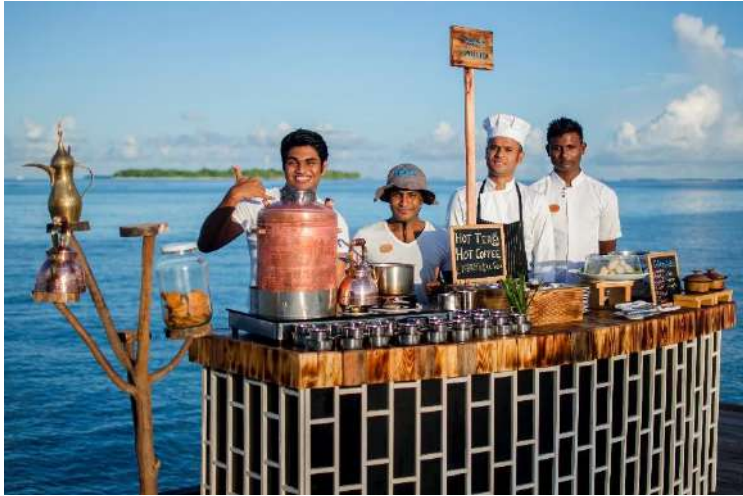
Afternoon tea & snacks