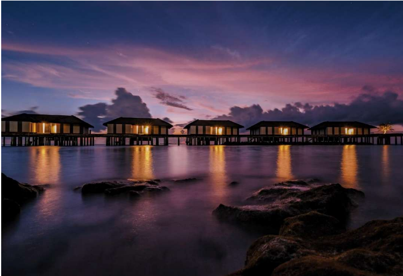
Western side of the island