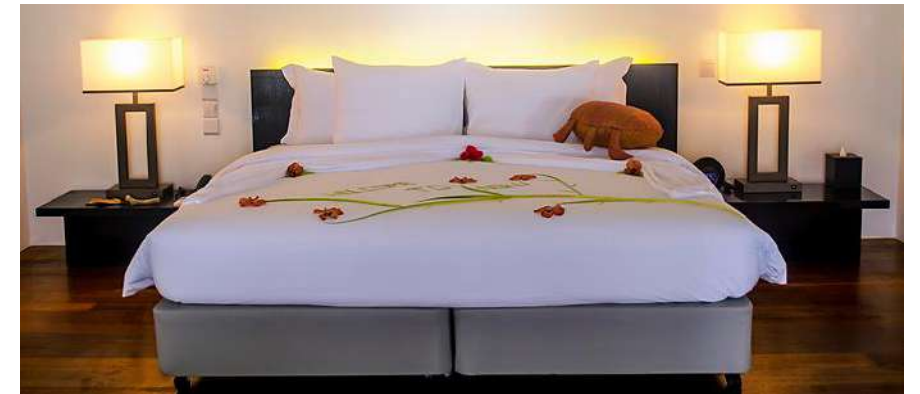
Max Occupancy: 2A + 1C