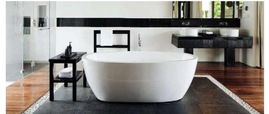
Max Occupancy: 2A + 1C