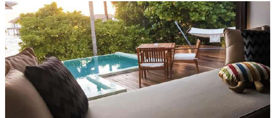
Max Occupancy: 2A + 1C