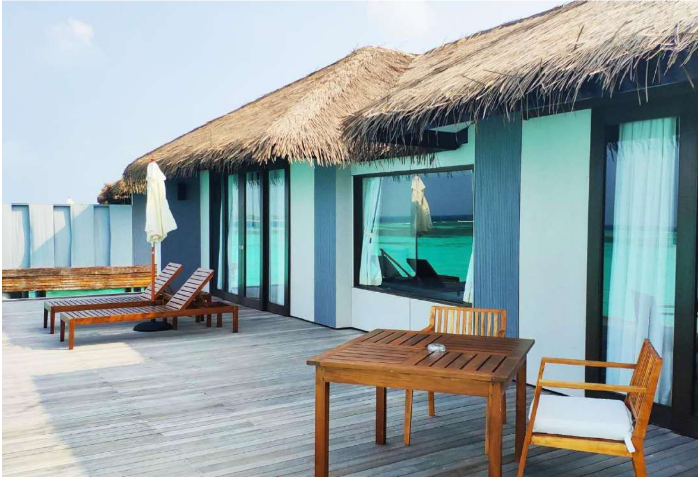
Eastern side of the island