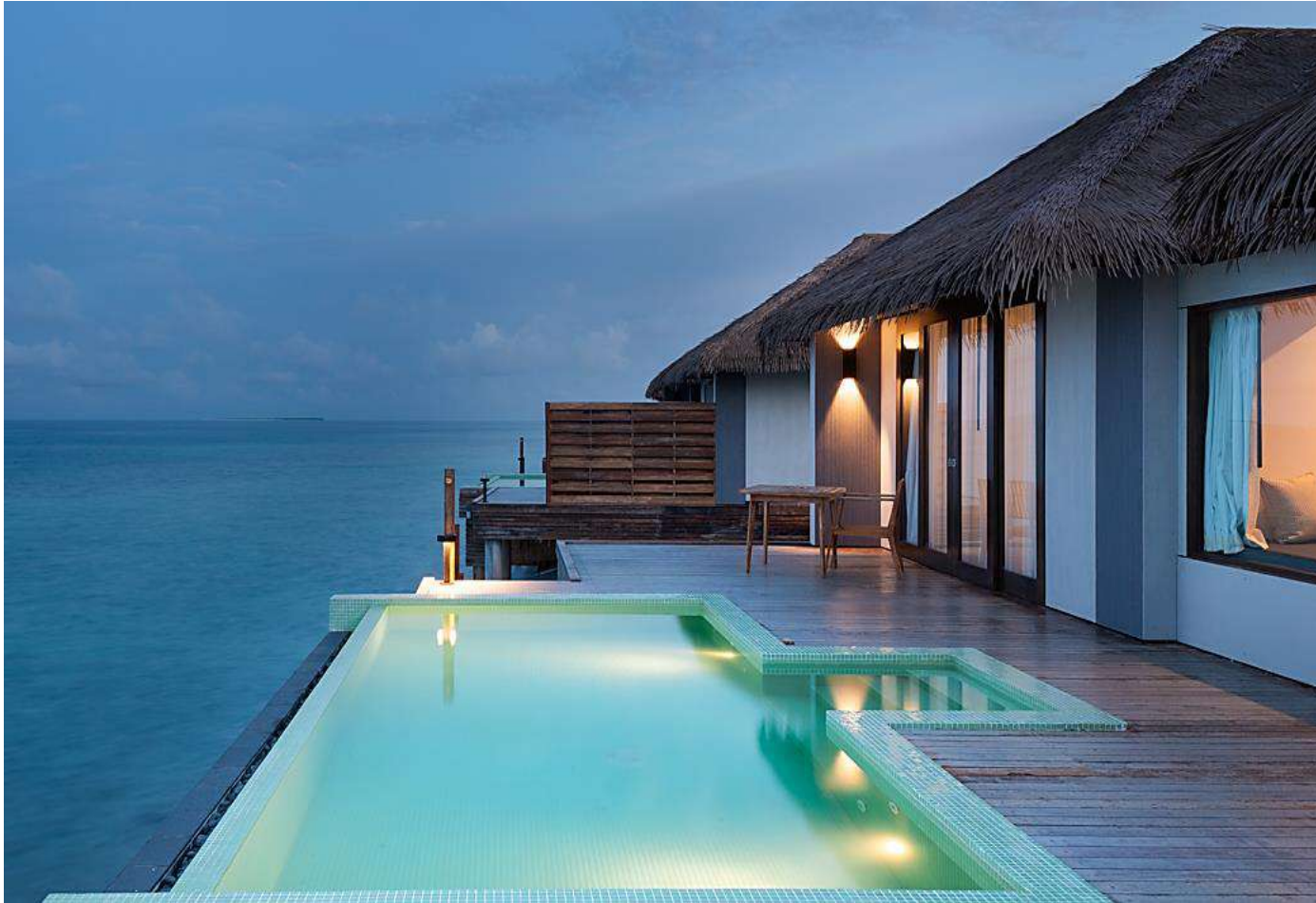
Eastern side of the island