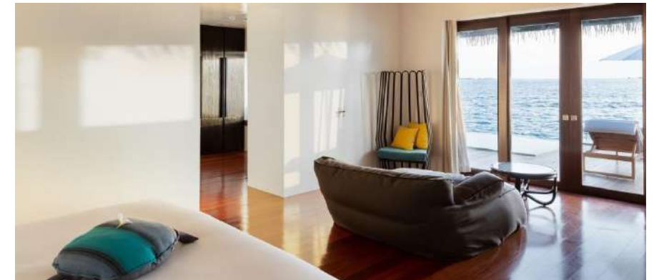
Max Occupancy: 2A + 1C